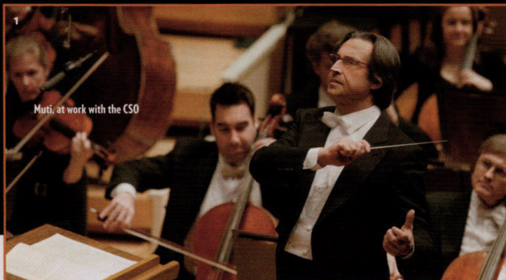
Muti, at work with the CSO